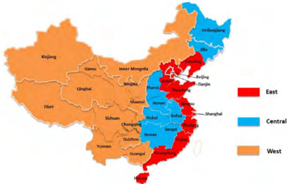
Figure 1 Provinces and Regions in China

standards at least once every two years, and compared to the previous legislation, penalties for violations quintupled – from a maximum of 100 percent to a maximum of 500 percent of